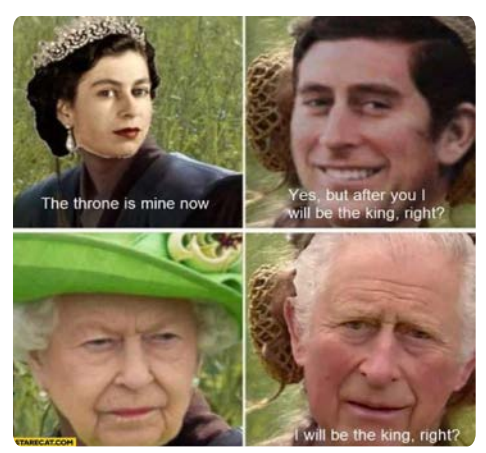
Fig. 2: 'Anakin and Padmé' meme.