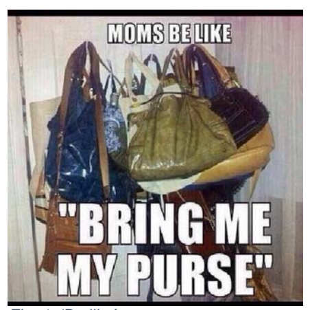
Fig. 1: 'Be like' meme.

Overall, we compare discourse spaces in linguistic and memetic constructions to propose an interpretation of their frame-metonymic role in representing attitudes and emotions. We argue that multimodal artifacts such as memes employ constructionally determined combinations of linguistic forms and images to profile multiple stances and arrange them into complex stance-stacking constructions (Dancygier 2012). We show how the multimodal structure of memes is exploited in constructionally supported stance configurations. These examples support our proposed view of multimodal constructions as stance-stacking constructions.