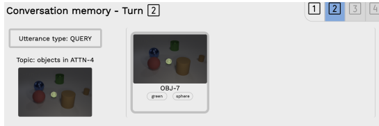
Figure 2: The conversation memory part of the demonstration which shows the conversation memory after two turns.

the question is ‘query’. ‘Attention-4’ is the visualisation of the topic of the turn. The attributes that are conveyed in the dialogue are symbolically added to the memory. In this case, the attribute ‘green’ was known from the previous turn and the attribute ‘sphere’ was added in the second turn. The demonstration gives the user the option to view the previous turns in the dialogue, so that it becomes clear how the information is built up over the dialogue turns.