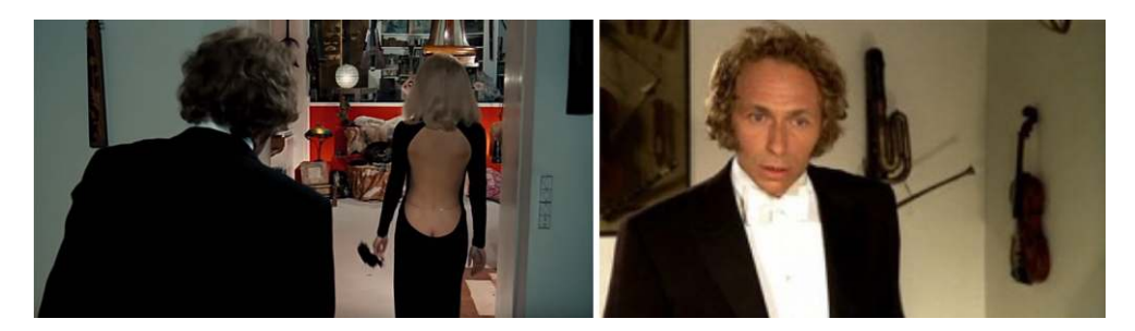
Figure 2. Comedy is in Pierre Richard's gaze in Le Grand Blond avec une chaussure noire.